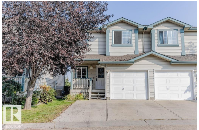
7-2004 Grantham Ct NW, Edmonton, AB